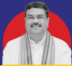
Sh. Dharmendra Pradhan Union Minister of Education, Government of India