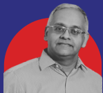
Sridhar Venkat Mishra Patra Foundation