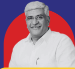
Sh. Gajendra Singh Shekhawat Union Minister of Culture, Government of India