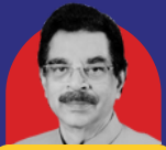
Shri Hari Babu Kambhampati Hon'ble Governor of Odisha