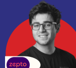
Aadit Palicha Zepto