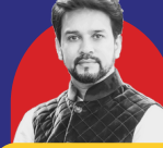
Sh. Anurag Singh Thakur Member of Parliament