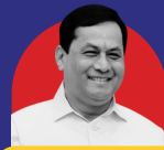
Sh. Sarbanand Sonowal Union Minister of Ports, Shipping And Waterways