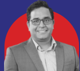
Vijay Shekhar Sharma