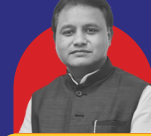
Sh. Mohan Charan Majhi Hon'ble CM of Odisha