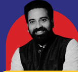
Anubhav Singh Bassi