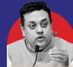
Sambit Patra MP, Puri, Odisha