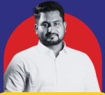
Sh. Suryabanshi Suraj Minister of Odia Language, Literature & Culture, Government of Odisha